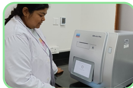
Digital PCR platform