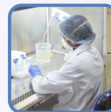
Propagation of virus in cell culture