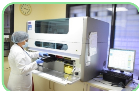
Automated nucleic acid extraction unit