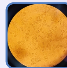
Microscopic image of virus-infected cells