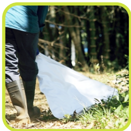
Cloth dragging for tick collection

Tailored for doctoral students, researchers, and public health professionals, this program aims to enhance participants' capabilities in conducting entomological activities relevant to disease control and research. By completing this course, learners will be well-prepared to pursue advanced training in medical entomology and related fields.