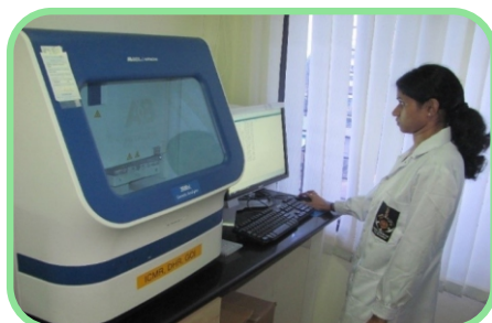
Modified Sanger sequencing machine- ABI 3500 XL genetic analyser