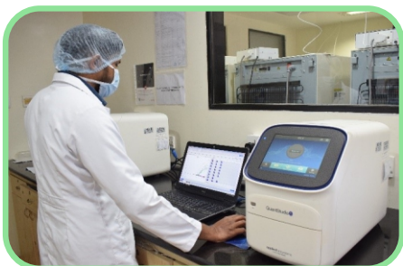
Multiplex real-time PCR platform