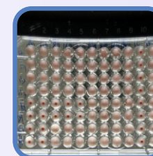
A 96 well plate showing hemagglutination