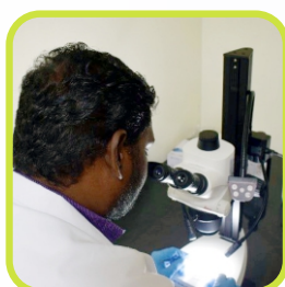
Observation of ticks and mosquitoes under the stereo microscope