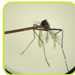
Stereo microscopic image of Aedes albopictus