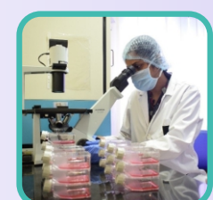
Microscopic observation of cell line under an inverted microscope