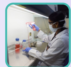
Laboratory technologist performing subculture of cell line